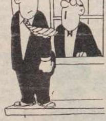
"Make up your mind. There's a queue banging on my door for your job."