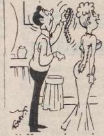
"My zippers jammed - give it a good tug."