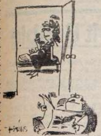
"I'd better ring off now Sandra - Daddy's knuckles are going white again."