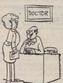
"Let's confuse everyone and start surgery on time."