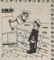
"Now don't forget Dobson - that's 150 hot-dogs with mustard and 100 without."