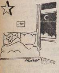
"Now you've opened the window, Fred, I can hear moaning in the bushes."