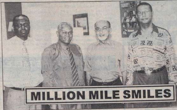
MILLION MILE SMILES