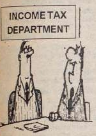
"I owe Shs. 50,000 - Just when am I supposed to have borrowed this money?"