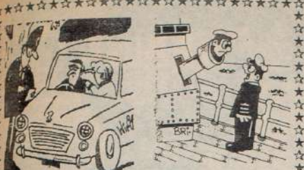
"Ignore him officer - It's only the drink talking."