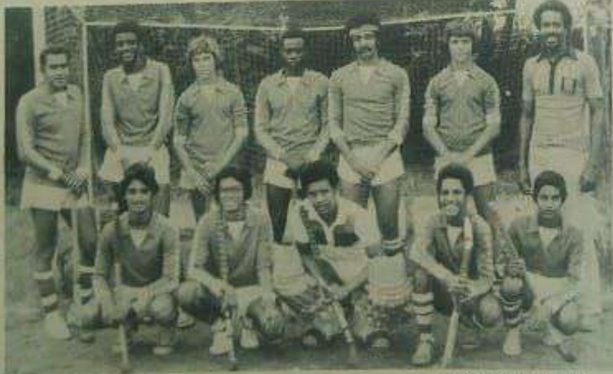
THE BAOBAB GREEN team who defeated Coast's SIKH YOUNGSTERS