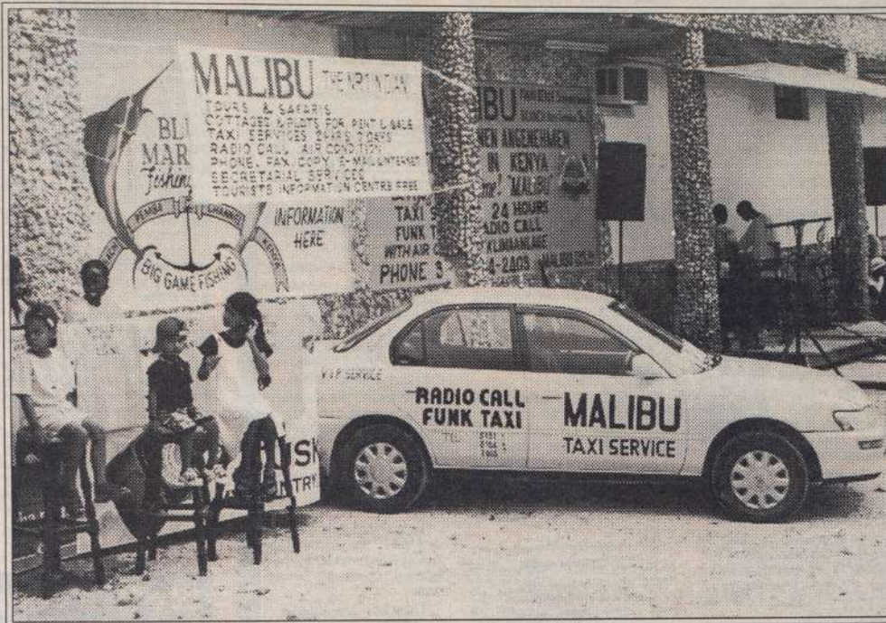
A MALIBU promotion and charity function when MALIBU T shirts were distributed

"I think if you offer a first class, reliable and competitive business, and you work hard (I work seventeen hours