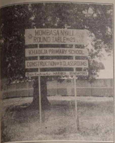
SIGN OF THE TIMES - The board that prominently points out the good work being done by the Mombasa Nyali Round Table No. 25 in the construction of three brand-new classrooms for the Khadija Primary School.

Helping Out With Three Classrooms For Khadija Primary