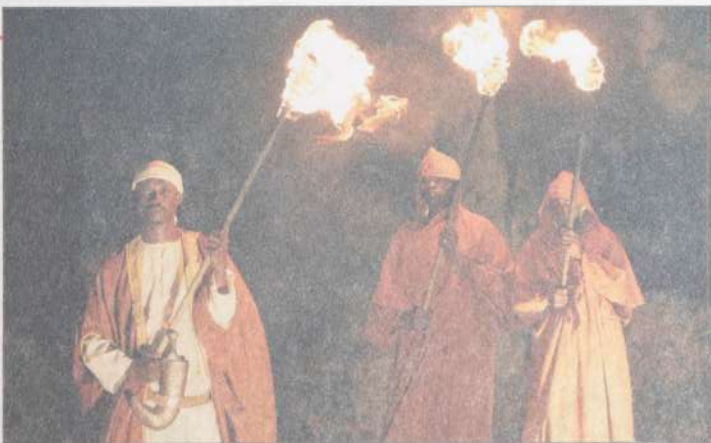
Actors from the Severin Travel group go through their paces as they perform during the "Sound and Light Show" which was staged for the first time in 1995 but temporarily stopped in 2014 at Fort Jesus by the Severin Sea Lodge Resort. Visitors at Coast can again enjoy the atmosphere at Fort Jesus, after sunset and watch the show "Mombasa by Night". The elaborately staged Sound and Light Show makes one experience the eventful history of Kenya's biggest and oldest seaport in an impressive way. During the show guests enjoy a dinner under starry sky. During the show "Mombasa by Night" all the epochs of the interesting history between 1480 and 1963 are shown in a colorful and vivid manner.