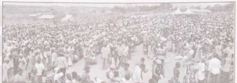
Seen above are 3000 people and children of drought stricken Ganze, Kilifi County queue to receive their share of food and other items doanted by Lions Club Mombasa Pwani.

In keeping with their Lions International and District slogans, "Relieving the Hunger" and "Be A Centennial Hero", Lions Club of Mombasa Pwani have continued with such activities in assisting the less fortunate members of society.