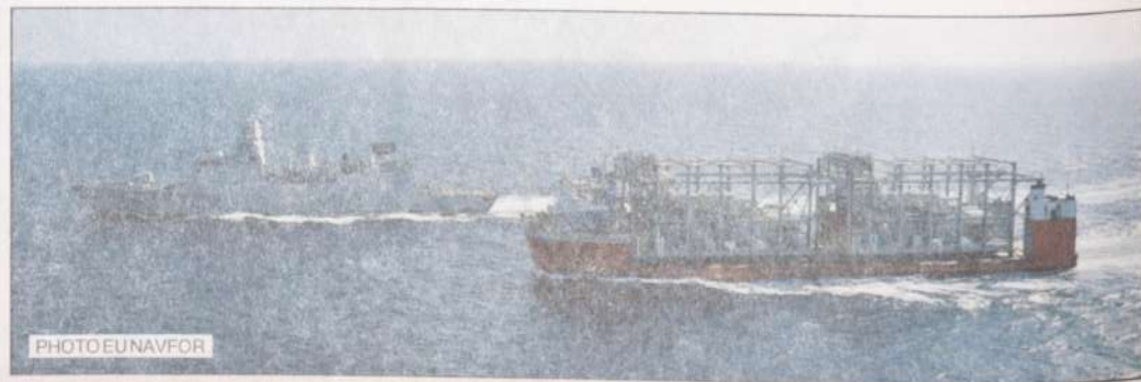
OFF SOMALIA (Operation Atalanta) -- Dutch-flagged cargo ship, Super Servant 3, is seen under escort from Operation Atalanta flagship HNLMS Tromp during the large carrier's safe and uneventful transit from Safaga in Egypt to Abu Dhabi in the UAE.

Super Servant 3 stated: "We very much appreciate the efforts of the Dutch Marines to keep our ship safe and ensure a safe passage through the Indian Ocean."