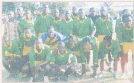
Kongowea United FC team prior to one of their recent matches.

Kaloleni United have their fingers crossed as they awaited for the verdict of their abandoned ties against Taifa Sisaal FC to know their fate as far as mini league qualification is concerned.