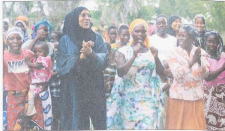
WATER PROJECTS AT WITU - Lamu County Women Representative Shakila Abdalla [centre] joins locals in a dance and Songs at Tangeni Village, Witu in Lamu County last Wednesday. Shakila was attending a fund raising meeting for the construction of a fresh water project that will assist the locals including school children who are said to miss classes while searching for water from long distances. Also affected by the acute fresh water shortages are the locals in Mokowe mainland who currently buy a jerrycan of fresh water from Hindi at cost of Sh.30 each.