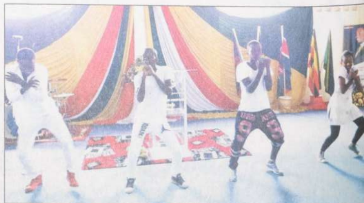
The newly introduced dancers at Enlightened Christian Gathering Church Mombasa Branch thrills the congregation with their eye catching dancing moves in preparation for Christmas festivities to be celebrated in two weeks time worldwide.