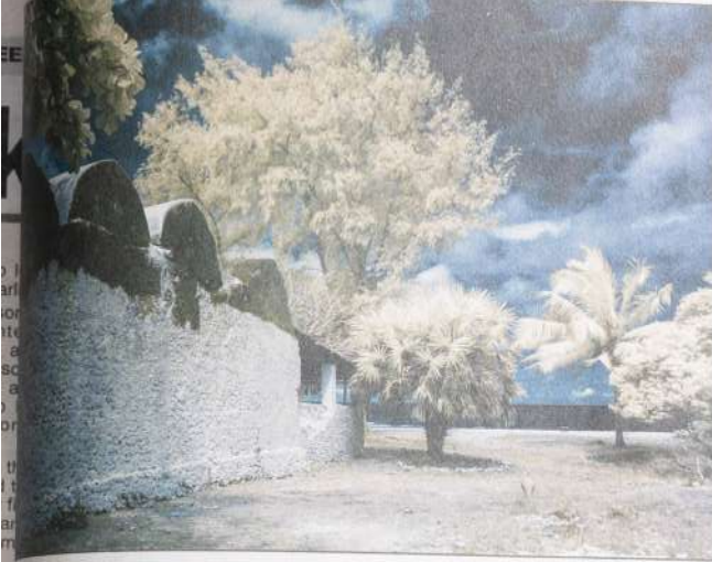
On the northern most tip of the Kenya South Coast's famous Diani Beach, a wonderful spiritual monument known today as 'Kongo Mosque' (formerly Diani Mosque). Built using coral stones in the 14 th Century it is reputed to be one of the most unique mosques ever built in East Africa that is still being frequented by pilgrims on a daily basis. It was listed in 1983 as one of the sites and monuments of historic value maintained by the National Museums of Kenya.