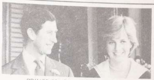
PRINCE Charles and Princess Diana.

CAN Barclays Bank, Magadi Soda and British Airways in collaboration with V.O.K. kindly tell us what made them think that we were eager to watch Prince Charles' wedding on television?