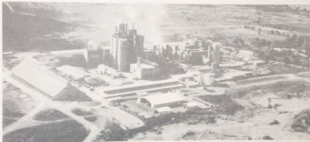
THE HUGE factory complex of the Bamburi Portland Cement Company near Mombasa on the Kenya North Coast.

What is surprising of all is to note that Bamburi has a larger capacity than any factory in the world, New Zealand, Israel, Malaysia, Thailand and China and ranks second in India. In the Cembureau Directory we have mentioned the following position Bamburi would occupy if the factory situated in the