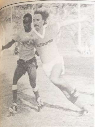
Die schwungvolle Fußballspieler in dem spannenden Match gegen das Hotelteam.