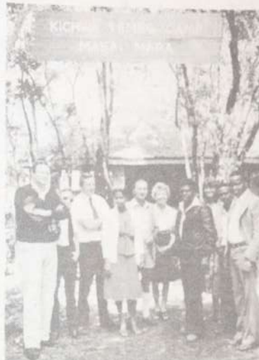
Im Kichwa Tembo Camp trafen sich Vertreter von African Tours & Hotels, der Safarifirma Abercrombie & Kent und von der Fluggesellschaft Sunbird, um die Vorbereitungen für die nächste Touristensaison zu besprechen.

Die Aussicht aus der Vogelschau ist einmalig.