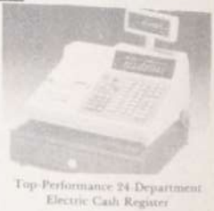
Top-Performance 24 Department Electric Cash Register