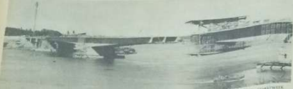
• THE new Nyali Bridge mid-week... almost there now!