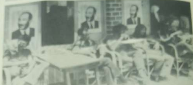
EGYPTIAN troops have taken control over the Sinai town of ADABA, after it was formally handed over by the Israelis during President Anwar Sadat's historic visit. Off-duty Israeli soldiers are pictured outside an Ad Arabah cafe prior to moving back home to Tel Aviv.

(The text is partially obscured and difficult to read in this section.)