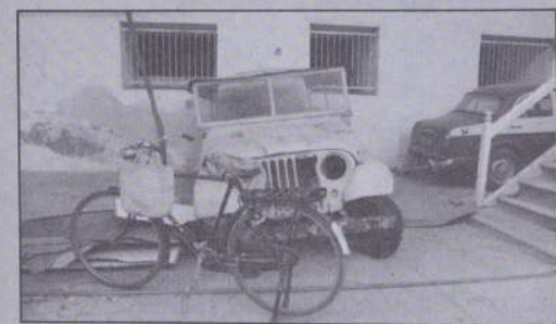
For 'The Box', Bhimji has responded to Zanzibar's political history as part of an ongoing exploration of colonialism in India, Africa and Britain.

Characteristic of her work, the space is documented in a state of abandonment; a dilapidated, rusty truck balances its weight on a flat tyre, whilst a vintage car is parked in the background with its bumper trailing on the