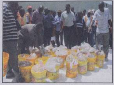
MOMBASA (Xinhua) -- Police officers display 341.7 kilogrammes of heroin seized from inside the Vessel Mv Bushehr Amin Darya alias Al Noor.