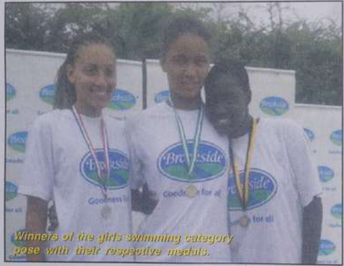
Winners of the girls swimming category pose with their respective medals.