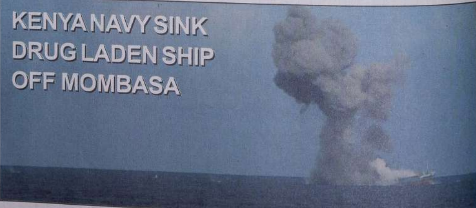
MOMBASA (Xinhua) -- Smoke billows from the Vessel 'Mv Bushehr Amin Darya' alias 'Al Noor' during its destruction at Delta-16 off Mombasa. Kenya Navy destroyed and sunk a drug-laden ship off the port of Mombasa in an operation that showed the government's commitment to deal decisively with illicit drug trade.