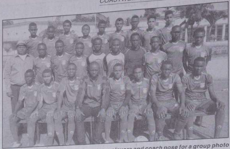
Bandari Youth FC Under-19 soccer team players and coach pose for a group photo after a training session at their Mbaraki Sports Club. Bandari Youth are leading the Mombasa County Hassan Joho Foundation League.