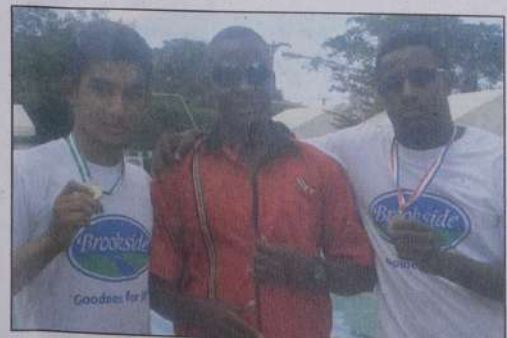
Some of Kenyan swimmers who won medals in the East Africa Secondary School Games in Dar es Salaam, Tanzania.