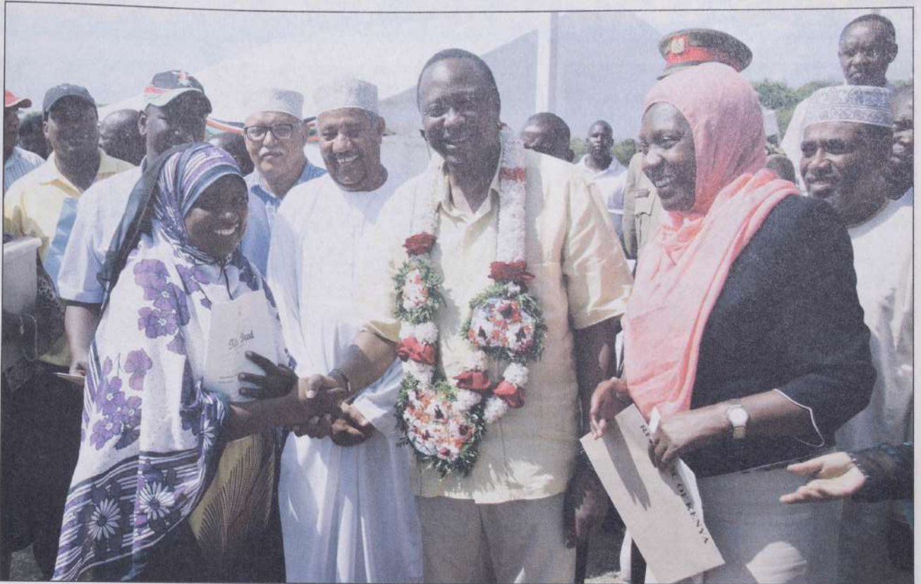
LAMU (Xinhua) -- President Uhuru Kenyatta is greeted by a resident of Pate Island after she received her official land 'title deed' from His Excellency during a ceremony of issuance of title deeds in Lamu County. Looking on [right] are Cabinet Secretary for Lands, Housing and Urban Development Charity Ngilu and [centre] Lamu County Governor Issa Timamy. The President and his deputy William Ruto attended the ceremony on Pate Island, Lamu County, where he issued over 2,000 title deeds to residents.