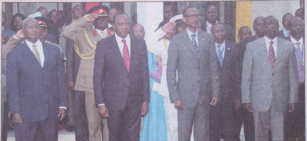
The three heads of states after releasing a joint communiqué at the second Infrastructure summit for the East African Community at Sarova Whitesands Beach Resort and Spa. Seen (from left) H.E. Yoweri Museveni of Uganda, H.E. Uhuru Kenyatta, H.E. Paul Kagame of Rwanda. Looking on is Deputy President H.E. William Ruto (right).