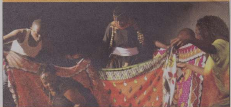
The Theatre company cast of Shungwaaya premiers at the little theatre club on 12th and 13th October at 3pm and 6pm.

The concert will feature artists from Aga Khan Academy, Juukua the band, Mombasa Academy, Taiana Africa and Ufalme Africa.