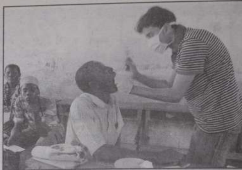
Doctors attend to some of the patients who flocked Takaungu Primary School for the free medical camp organised by XFOR security last weekend.

Last shows of Brave on Saturday and Sunday with Friends and Family offer.