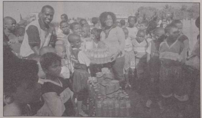
The participants receive 20 cartons of water and 10 tins of glucose from Kenya Maritime Authority.

The MG drivers spoke warmly about the enthusiasm of the crowd, the Nairobi Racecourse venue and the organisation of the event.