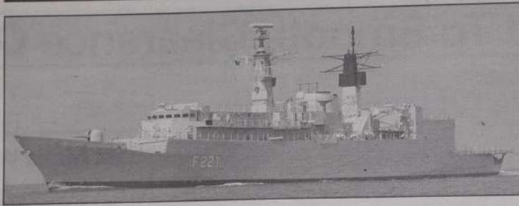
Romanian frigate ROS Regele Ferdinand has joined the European Union Naval Force (EU NAVFOR) - Operation ATALANTA, combating piracy off Somalia. She is the first Romanian warship to take part in the EU's counter-piracy operation. Commissioned into the Romanian Navy in 2004, the 146 metres long warship has a displacement of 4166 tonnes, a crew of 203 and has a Puma helicopter embarked. The Romanian vessel joins a fleet of EU NAVFOR warships tasked with the deterrence and disruption of piracy in the Somali Basin and Horn of Africa and the protection of World Food Programme vessels and vulnerable shipping.