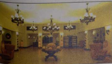
Plush reception at Nyali International Beach Hotel and Spa.