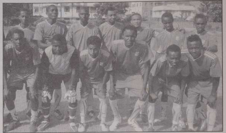
Gulshan FC, one of the teams taking part in the South Coast Premier League pose for a group photo prior to one of their matches.

Police will go flat out to beat sixth positioned Kariobangi Sharks tomorrow and pray Bandari edge Bidco United so they can jump to second spot.