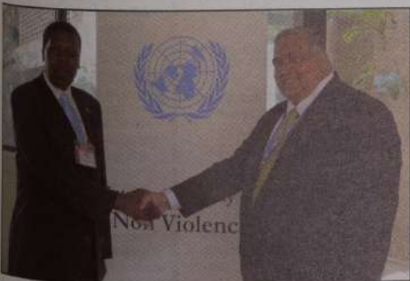
Hon. Eugene Wamalwa, Minister for Justice, National Cohesion and Constitutional Affairs and High Commissioner for India and the Permanent Representative to UNEP, UN-HABITAT India, His Excellency Sibabrata Tripathi congratulate each other on the successful celebration of Gandhi Jayanti day which is also marked as the official Non-Violence day by the United Nations worldwide. The event was held at the United Nations offices in Gigiri.

On his return to India, Gandhi brought this little cap and it became a rage all over the country.