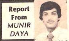
Report from MUNIR DAYA

Several unions have expressed grievances of being allocated low quotes for diesel thereby failing to mobilise transporters to carry out the task of collecting crops from remote villages.