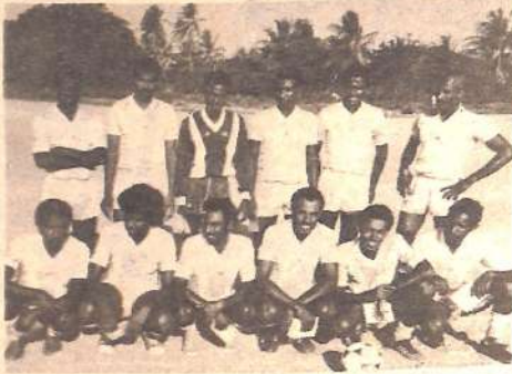
LAMU KIDS - the newly formed Lamu side, Brighter Star FC, all set to clinch Next Year's District League, seen posing during a training session.

Our Kenya National Football League Representative, Wanderers travels to Nairobi to take on AFC Leopards tomorrow (Saturday) at Nyayo National Stadium before meeting Reunion in another Superleague match at City Stadium on