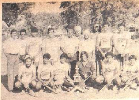
TOP CLASS HOCKEY - Mombasa Youngsters pose for a group photo after winning the Kenyatta Cup. Today, the Coast Hockey "Giants" clash against the West German team at Aryans ground. (See Story Page 19).