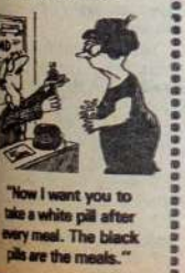
"Now I want you to take a white pill after every meal. The black pills are the meals."