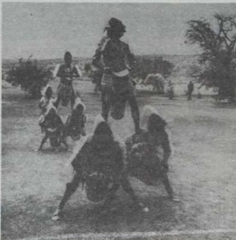
FAMOUS 'Chuka Dancers' performing at the Taita Hills Lodge.

With low season rates for a twin with full board only Kshs 710 at Taita Hills and Kshs 785 at Salt Lick Lodge. Good value in this day and age of increases.