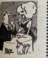
"Let's try and have a lasting relationship... say, six weeks?"