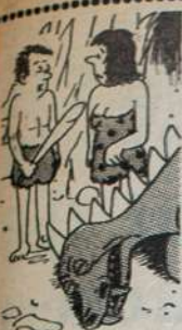
"Just kill it. Getting it into the cooking pot is your job."

giving publicity to Kenya. The TV unit found Kenya an excellent country in which to film". They pointed out that by shooting three episodes in Kenya which will be seen by millions of viewers in Germany, Austria and Switzerland, more interest in the country was bound to be generated and tourism promoted. One of the scenes being filmed at Serena Beach Hotel was a colourful performance by the Mabumbubu Kayamba traditional Giriama dancers from Porini, Kikambala. DO NOT MISS the 'Alan Root' film being screened on Tuesday, December 21, from 7.30 p.m. at Fort Jesus Museum, Mombasa.