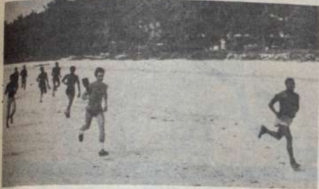
THE SEVERIN "Olympics" torch is carried during the run from Kenyatta Beach to Severin Sea Lodge.