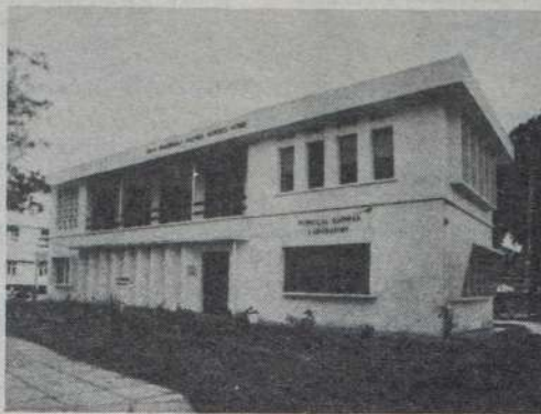
PANDYA CLINIC — Popatlal Karman Laboratory and Bhagwanji Kachra Nurses Quarters.

Institutions like the Pandya Memorial Clinic attempt to serve these people on a no profit basis. Any profit that is made is marginal and it is reinvested in expansion