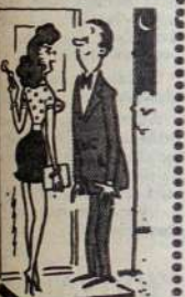
"You'll like my parents - they've gone to Canada for three weeks!"