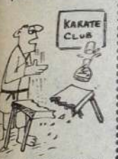
"Now call this meeting to order!"