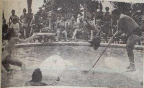
THERE WERE fun competitions in the pool during the Severin Sea Lodge "Olympics".