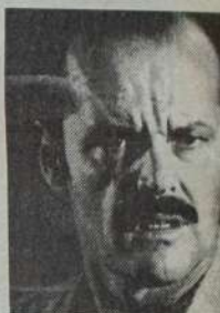
JACK NICHOLSON stars in 'The Border' showing at the KENYA

Running today and tomorrow at Kenya and Naaz cinema are The Border and Flash Gordon respectively.