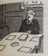
"As you all know, the company has had to make many redundancies this particular year."