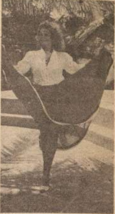
STEPPING OUT — A fashion show by Lawford's Boutique at Seafarer's Hotel was enjoyed by guests as well as members of the Skai Club of Mombasa and Young Explorers Club.

... cave again, and available for viewing.