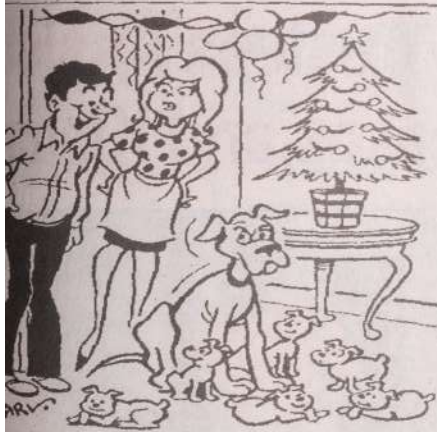
"Good! That's solved six Christmas presents."