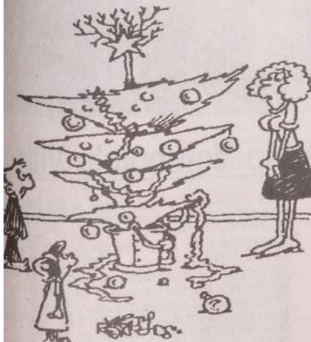
"Daddy put the tree up when he came back from the pub!"