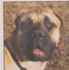
Clever canine sniffer.