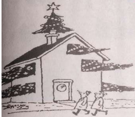
"Some people always have to go one better..."

WINE * DANCE * YOUR GUIDE TO HOLIDAY ENTERTAINMENT