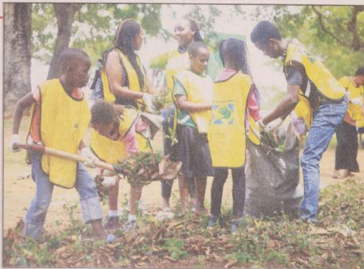
Members of the Church of Jesus Christ of Latter Day Saints drawn from the Mombasa branch participate during the annual cleaning exercise held at Mama Ngina Drive in Mvita constituency, Mombasa County.