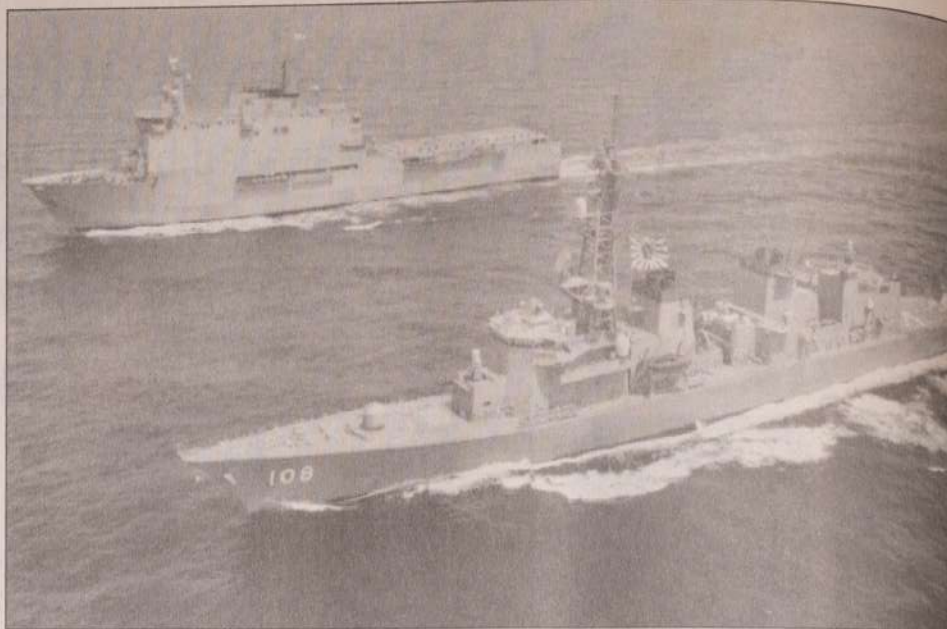
Japan Maritime Self-Defense Force (JMSDF)'s JS Akebono and the Spanish Navy's ESPS Castilla – flagship under the command of Combined Task Force (CTF) 151 and the European Union Naval Force (EU NAVFOR) CTF465 respectively – conduct a Passage Exercise (PASSEX) in the Gulf of Aden.

Walters for CONTAINER BERTHS - EVER DEVELOP. Walters for CONVENTIONAL BERTHS - NIL. Walters For SHIP CONVINIENCE - IRON LADY V; AN NAEEM; ALPHA. WAITERS FOR KOT - HIGH FIDELITY; HAIMA. Walters for SOT / MBK - BARGE WINA; ALDABRA; FUEL BARGE 1; MUSSA K.