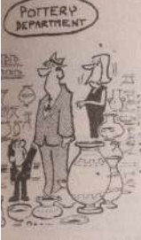
couldn't find a toilet but it's alright now!"