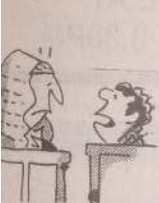
at least three people out of 34 million fine me guilty' and you call that justice?"