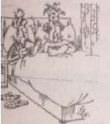
still think it would've been nice to go our anniversary."