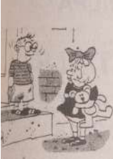
"I think my dad is entering the olympics. Mum said he is in a high jump when he gets home."