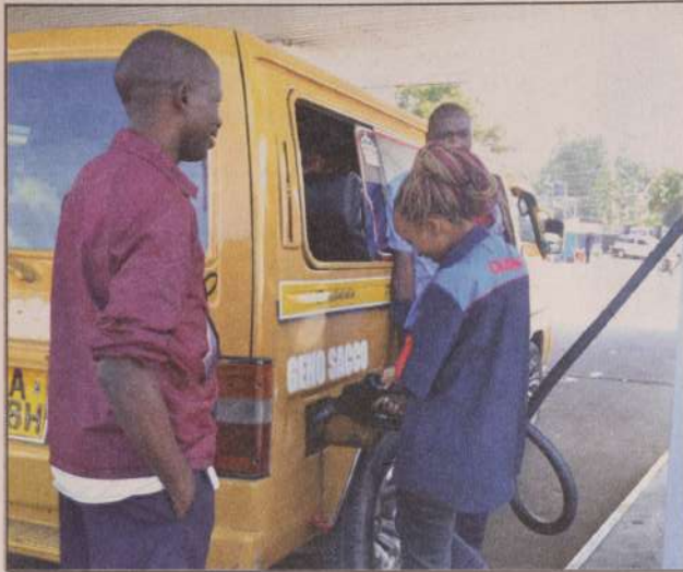
MOMBASA (Xinhua) — A fuel attendant fills a vehicle with fuel in Mombasa, Sept. 1, 2018. Kenya's revenue authority imposed a 16 percent value added tax (VAT) on all petroleum products on Saturday, defying lawmakers who had voted earlier to delay the levy for two years due to concerns about the cost of living. XINHUA PHOTO: ALLAN MUTISO