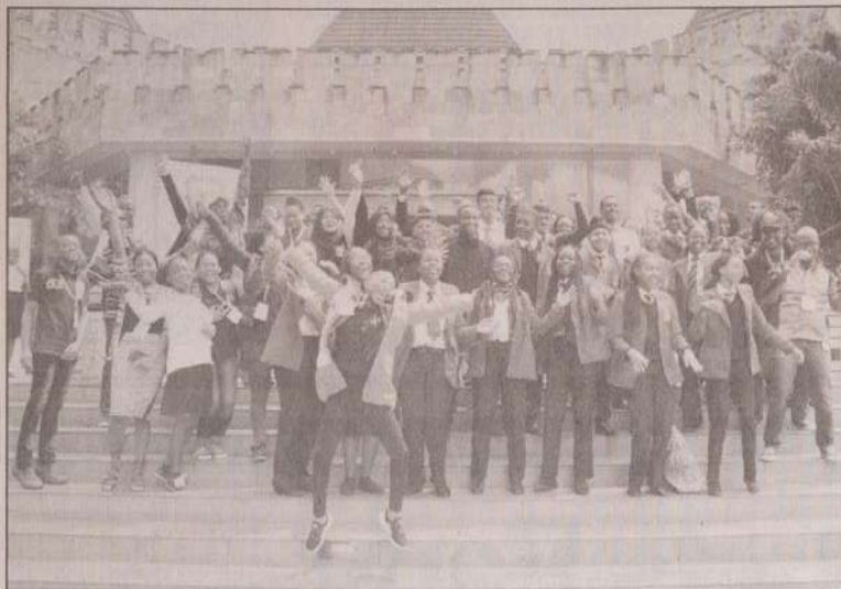
Google Kenya on 5 th September, kicked off the first ever Web Rangers Africa summit to tackle how to make the internet safer for young users. This student-led initiative in featured representatives and "Web Rangers" from Kenya, South Africa and Nigeria. They are gathered at Brookhouse School from 5 September till 7 September (today).