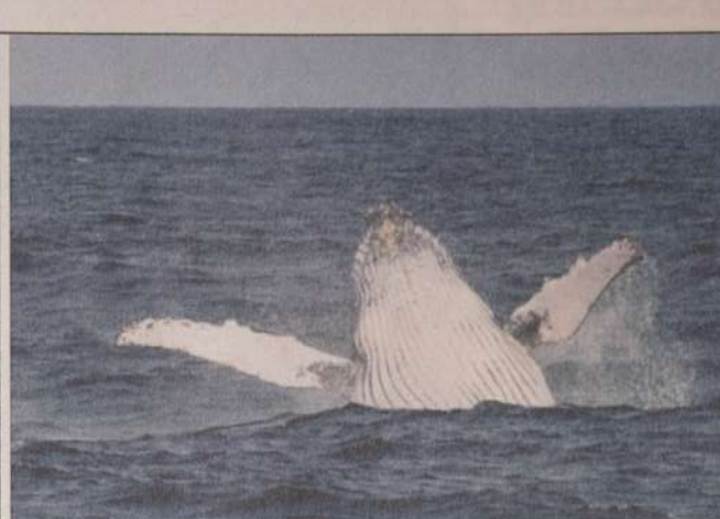
WATAMU (Kenya) -- Humpback whales, the giant marine mammals, travel annually in their hundreds from the Southern Ocean into the Indian Ocean travelling in tropical waters off the Kenya North Coast where it is safe to breed.