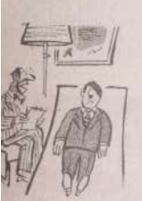
Well at least I have topped you thinking you were Napoleon."