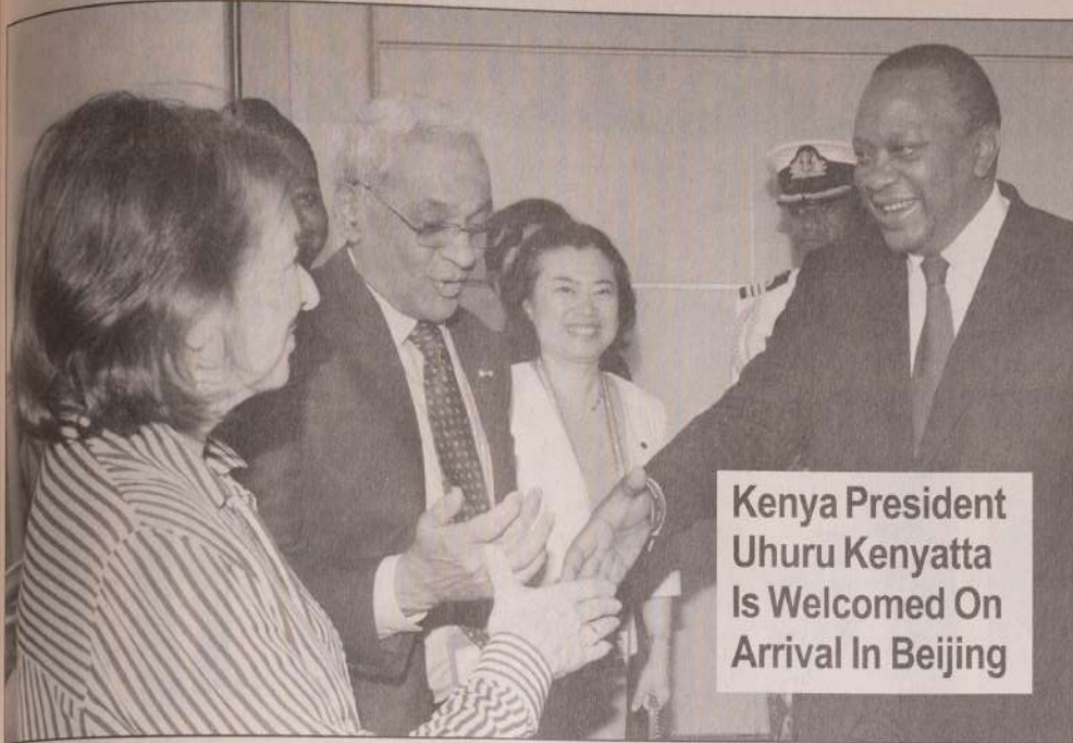
Kenya President Uhuru Kenyatta Is Welcomed On Arrival In Beijing

Kiptoo said Kenya is well positioned to tap into opportunities presented by international trade exhibitions to accelerate transition from subsistence to high tech manufacturing led economy.