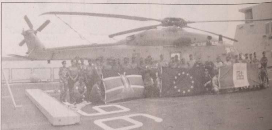
Kenyan Navy Mombasa complement join EU NAVFOR Italian Warship Federico Martinengo officers in Local Maritime Capacity Building (LMCB) combined exercise.

By working together as two international bodies we can work to deter piracy in the waters of the Gulf of Aden and the West Indian