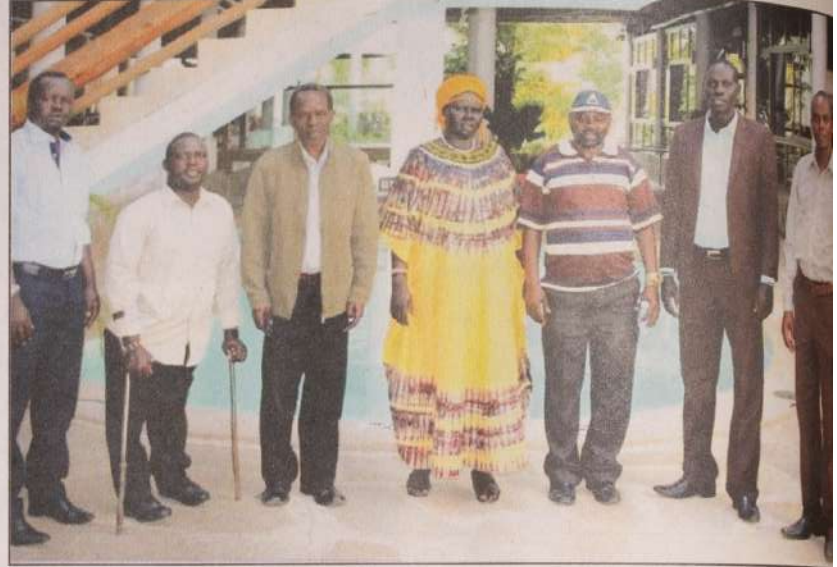
Some of the CRC Members from Kepenguria Constituency in North Eastern, on arrival at Travellers Beach Hotel Club and Spa for a one week induction Training. Over hundred delegates attended training.