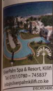
Silver Palm Spa & Resort, Killifi Tel: 0707/0780 - 745837 info@silverpalmkillifi.co.ke EYECATCHERS

MOMBASA TOP 25 OSHWAL ACADEMY 'HIGH ACHIEVERS' 2018 - PAGE SEVEN