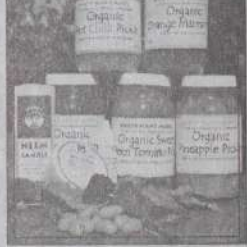
Jams, pickle and preserves.