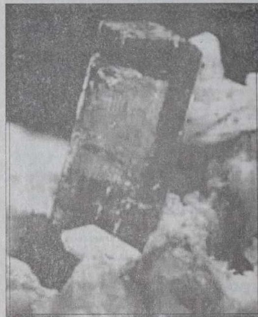
Es gibt viele grüne Turmaline in den Gebieten auf beiden Seiten entlang der Grenze zwischen Kenia und Tansania.

Turmalinkristalle enthalten oft mehrere Farbzonen (zweifärbig, dreifärbig oder