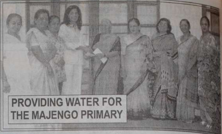
PROVIDING WATER FOR THE MAJENGO PRIMARY