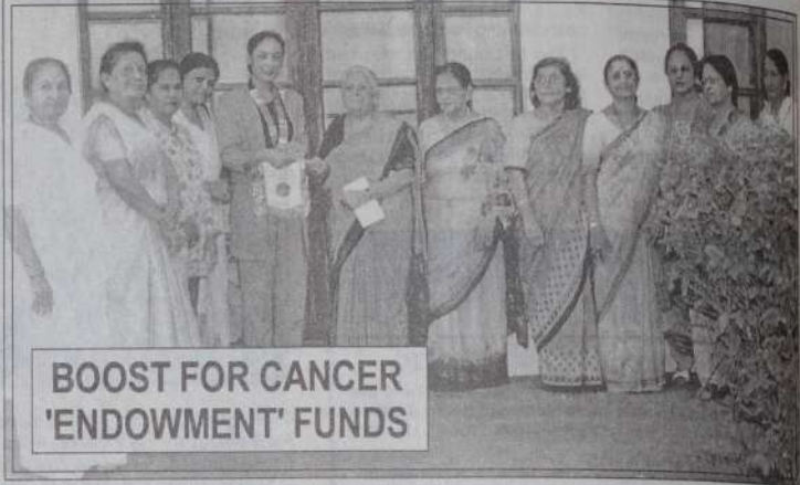
BOOST FOR CANCER 'ENDOWMENT' FUNDS