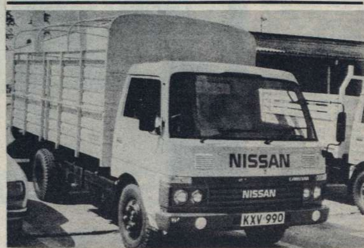
THE NISSAN CABSTAR - Class leader at the Coast in the 2-3 tonne category.

On arrival, his cronies jumped out of the car, thanked him