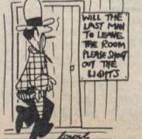
"WILL THE LAST MAN TO LEAVE THE ROOM PLEASE SHUT OFF THE LIGHTS"