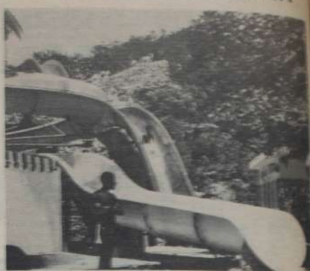
THERE ARE TWO WATER SLIDES in the new 'Water Park' at Mombasa Beach Hotel, one being the eleven-metre high 'Kamikaze'.

A BIG CROWD PULLER at Mombasa Beach Hotel over the festive season has been the new Water Park, with two huge water slides - one being the eleven metre high 'KAMIKAZE', for the more adventurous spirit. Tables and chairs have been conveniently set out to give a birds-eye-view of the water slides. A beach Cafe offers food and drink throughout the day. The hotel's swimming pool area is much more spacious and includes the 'Rendezvous', which also offers a selection of Kenya fruits and Italian ice cream.