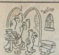
"Never mind about the porridge—where's the video gone?"

THE COPY CAT Nairobi Tel 26844/26701/27824 Mombasa Tel 316835 Kisumu Tel 41883