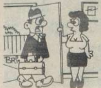
"My demand for a rise deteriorated into a plea to get my job back."