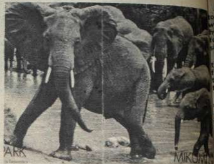
ELEPHANTS near Mikumi Game Lodge in Central Tanzania

They include the construction of beach hotels in Pemba, a game fishing lodge, renovation of existing hotels, establishment of new historical museums, and the development of small islets close to the town of Zanzibar and Pemba.