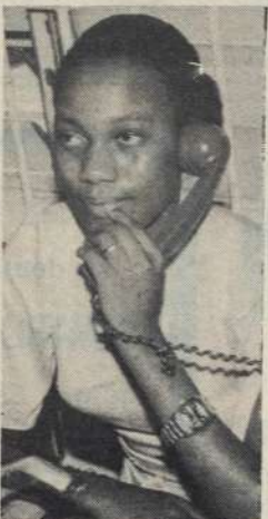
A HELPFUL receptionist at Dar-Es-Salaam's New Africa Hotel complex.

The two hotels, to be managed by the US international company Sheraton, will have a