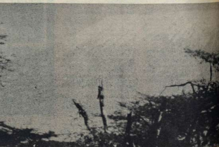
SOFTLY REVEALED in the early evening dusk, Mount Kilimanjaro is a superb sight