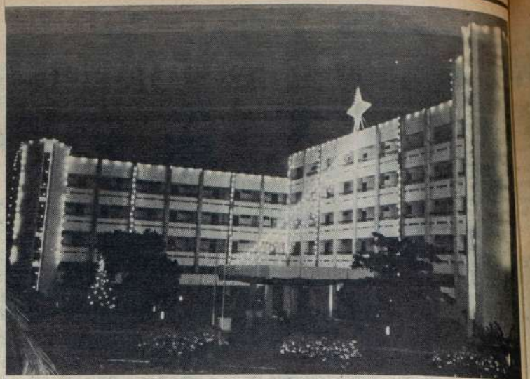
FIRST CHRISTMAS IN KENYA The Sheraton Overseas Management Corporation marked its first Christmas in Kenya with an official light switching ceremony performed by the Kwale District

The plast is presently the only marketer for fluorescent tubes in the PTA territory with most member countries importing completed tube lights.