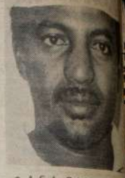
* A.S.A. BASKUTTAAH

He wished all his players, members and supporters all the best of luck during the new