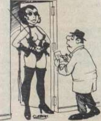
"Is this where they're holding the St Andrew's Social Club whist drive?"