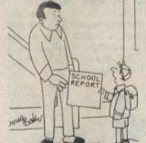
"Before you read it, may I remind you of the decline in teaching standards?"