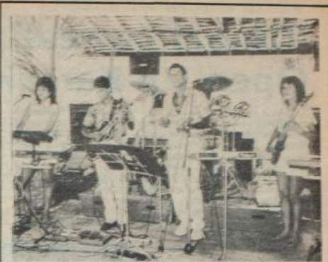
IT WAS A FEAST of curry, fashion-wear and jazz music on the Mvita Terrace at Nyal Beach Hotel, where the popular 'Outta Bounds' are seen (above) entertaining guests over the Christmas Holiday weekend.