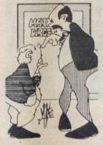
"I don't usually mix business with pleasure, but you're fired."