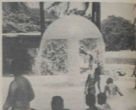
THE UNIQUE water mushroom in the new water park.

A BIG CROWD PULLER at Mombasa Beach Hotel over the festive season has been the new Water Park, with two huge water slides - one being the eleven metre high 'KAMIKAZE', for the more adventurous spirit. Tables and chairs have been conveniently set out to give a birds-eye-view of the water slides. A beach Cafe offers food and drink throughout the day. The hotel's swimming pool area is much more spacious and includes the 'Rendezvous', which also offers a selection of Kenya fruits and Italian ice cream.