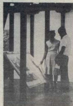
VISITORS looking at paintings in the new Gallery Azania.

They had never done such work before, and so they were trained on site to undertake carpentry, stonework, plastering, painting and been managed to achieve extremely good carving, to a highly